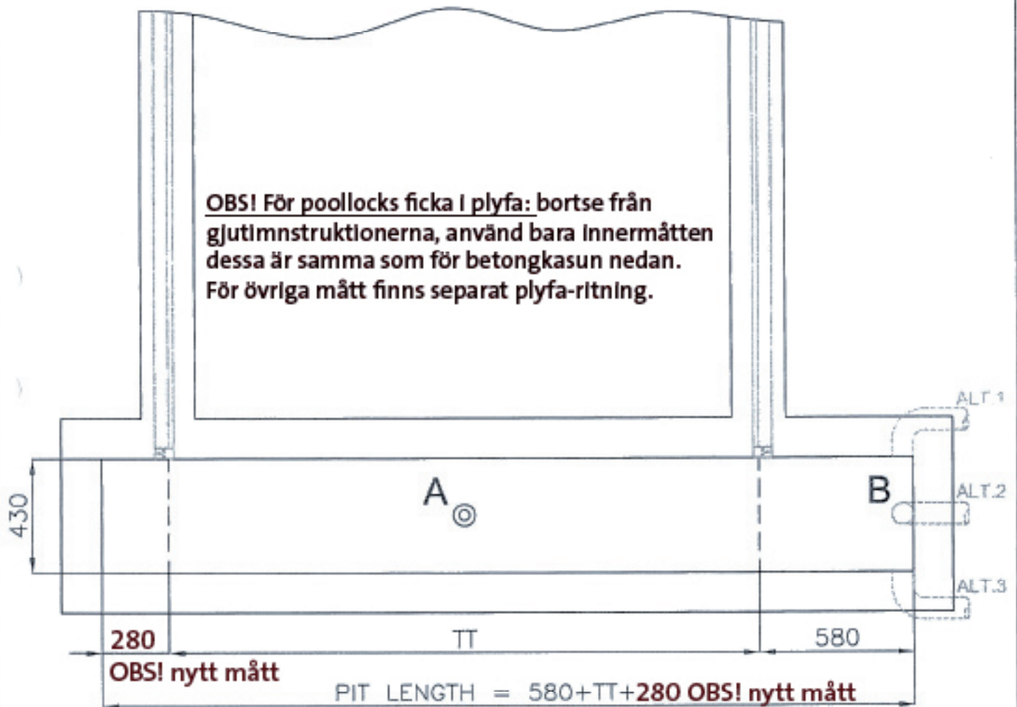
TRANSVERSAL SECTION IN PLACE A (SIDE VIEW)

OBS! För poollocks ficka i plyfa: bortse från gjutimnstruktionerna, använd bara innermått. Dessa är samma som för betongkasun nedan. För övriga mått finns separat plyfa-ritning.